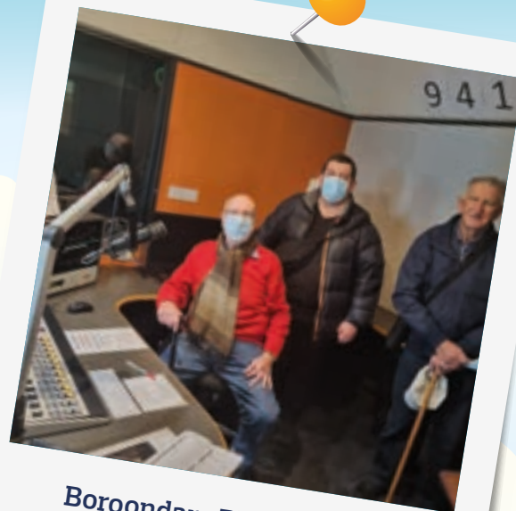
Boroondara Blokes tour of the 3MBS radio station

See the September/October Trips calendar for new and exciting upcoming destinations. (Bottom of pages 6-7).